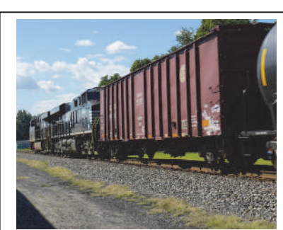
Oil unit trains are so heavy NS adds a distributed power pusher to east bound trains.