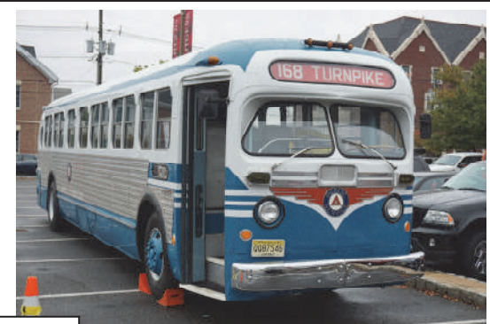
M720, a 1958 TDM5108 in Public Service colors. It is noteworthy as being an early suburban-type bus during the old look era, one of four buses brought to the meet by the Lakewood crew of the NJTHC.