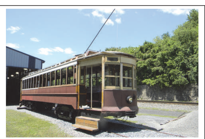
#8 Like the margarine of old, 2651 looks better with its bonnet on it.