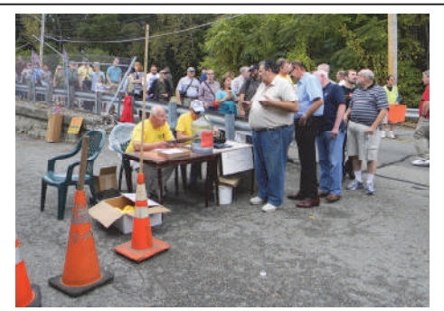
The volunteer staff had to get off to a quick start on this Sunday morning!