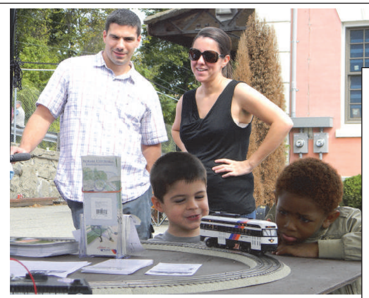
Kids of all sizes enjoyed the Trolley Loop.