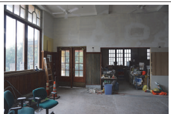
The wall on the Ladies Room side has been partially completed and the windows have been restored.