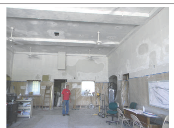
The ceiling in the Main Waiting Room has received its plaster undercoat.