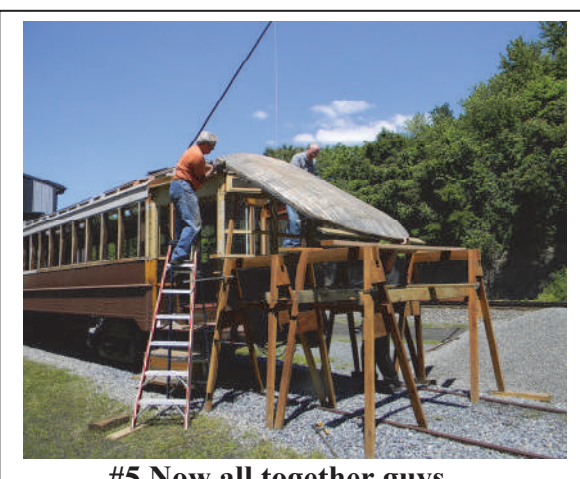
#5 Now all together guys... DSCN1095