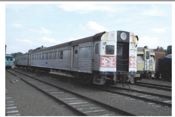
Two NH electric mu combines (washboards) cars (4671 & 4673) converted to wire work cars are on display DSCN1252