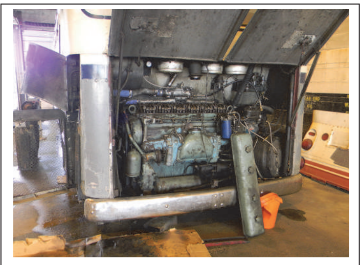
The J411 engine has been rebuilt and is awaiting a new radiator to come.