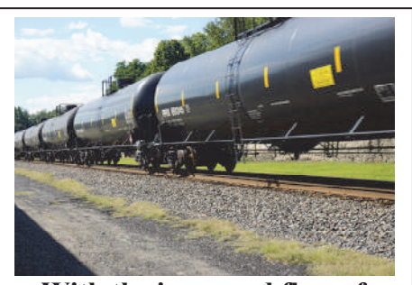
With the increased flow of heavy unit oil trains, safer and improved cars have been put into service.