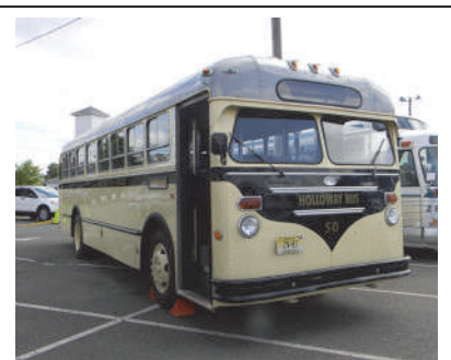
The Holloway BEAVER is one of the rarer models in the collection.