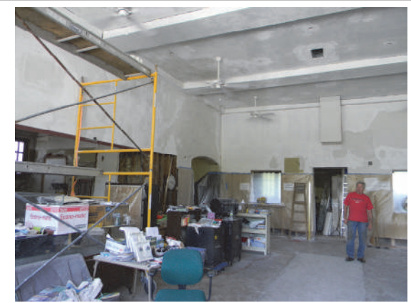
Bob Hooper inspects the freshly plastered ceiling.