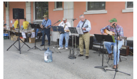
The Red Oak Country Boys played a rockin' "Wabash Cannonball".