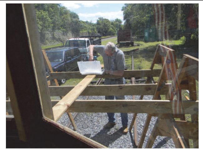
#3 Let's see...Place plank A on beams B &C.

...they are going to get the bonnet high enough to install it on the roof safely without a place to stand.