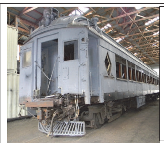
E-L3574 (DL&W 2574) Subscription parlor car owned by Whippany Rwy Museum, removed from service in 1984, is being restored by Star Trak.