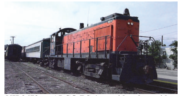
NH 9673 an ALCO RS-1 provides short rides in the yard.