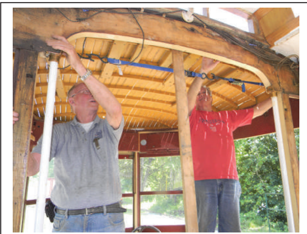
#9 Fitting a reluctant bonnet takes some determination