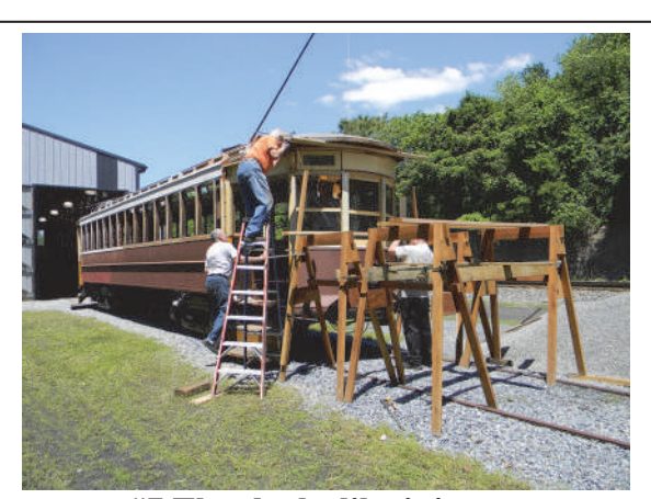
#7 That looks like it is secure.