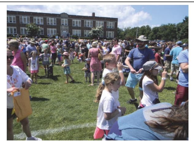
The crowd was large, loud and active. Everyone enjoyed the Fishawack activities