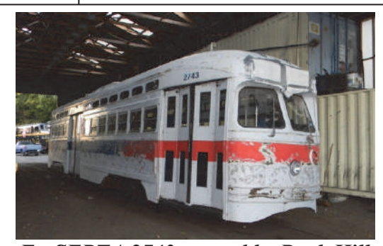
Ex-SEPTA 2743, owned by Rock Hill Trolley Museum, is in the shop for restoration and painting into the classic PRT green and cream.