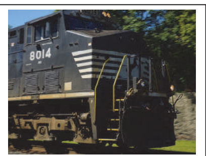
Norfolk Southern always provides a lot of entertainment.