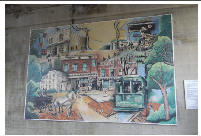
One of several large murals mounted on the NJT railroad overpass abutments includes a Morris County Traction Co. trolley car.