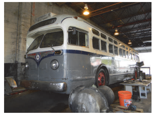
PSCT Bus # J411, a 1955 GMC TDH "old look", rests in the garage pending completion of a total overhaul.