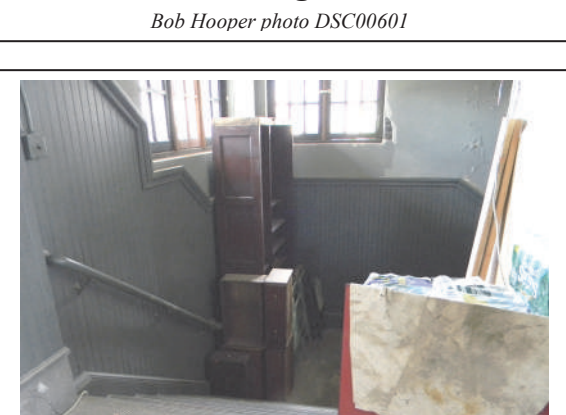
The ticket cabinet temporarily occupies the landing of the DL&W side stairs.