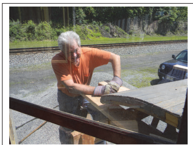
#4 I don't know. It fit on the drawing. DSCN1088