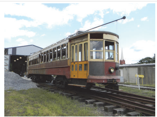
2651 makes it to the switch frog on the west end of the building.