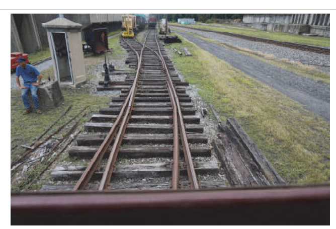
New territory: out the west end of the building as we push to expand our range. We just need a longer extension cord!