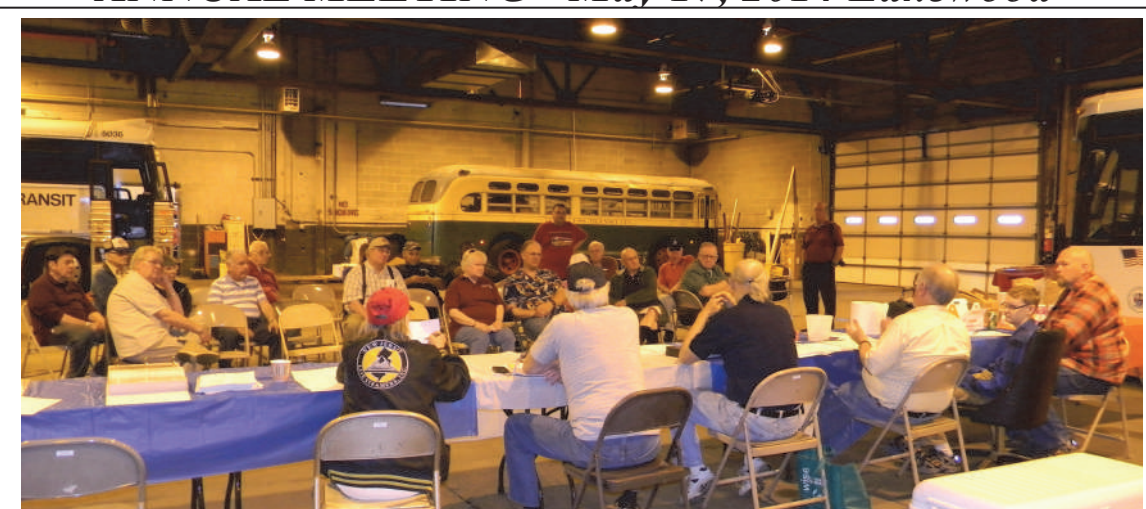
The 2014 Annual Meeting of the Friends of the NJTHC was held at the Lakewood Garage on May 17, 2014.