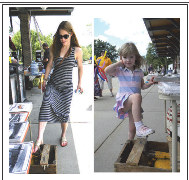
As is NJERHS' custom, we provided our trolley bell. Everyone enjoyed a good ring!