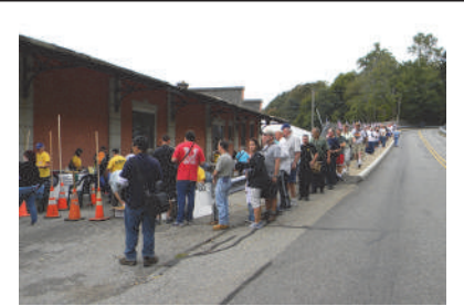
The crowd arrived early at the gate of URHS Boonton Restoration Yard