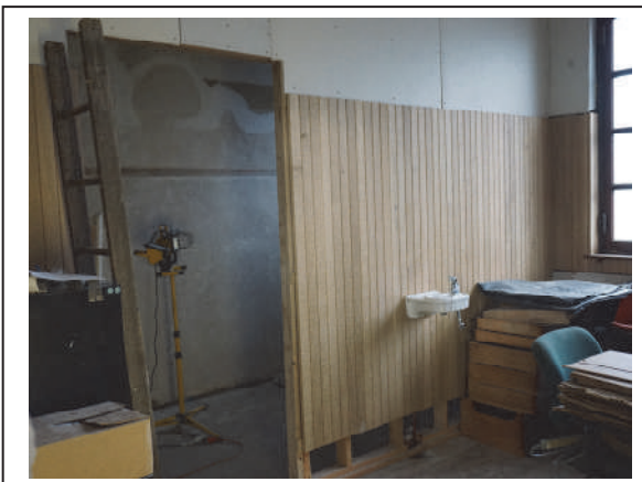
The wall in the Men's room has been completed and the drinking foundation hung.