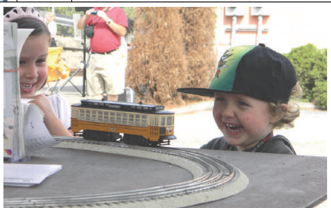
Even in this time of computer games, the trolley still exerts its fascination!