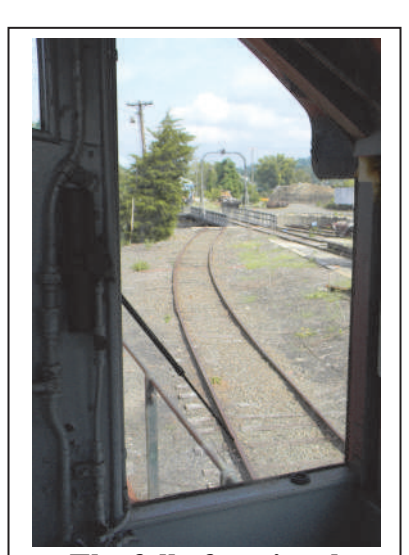
The fully functional turntable forms the center piece for the museum, viewed here from the RS-1 cab.